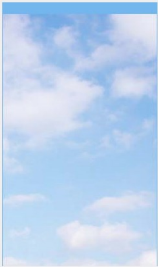
Weather Forecast | Weather Maps | Weather Radar